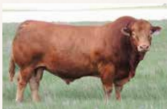
TREF ZEUS 232Z