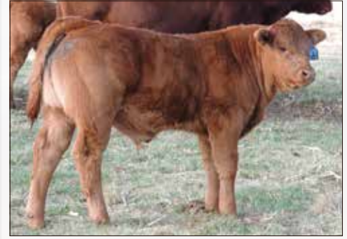
LOT 4 • Pictured as calf