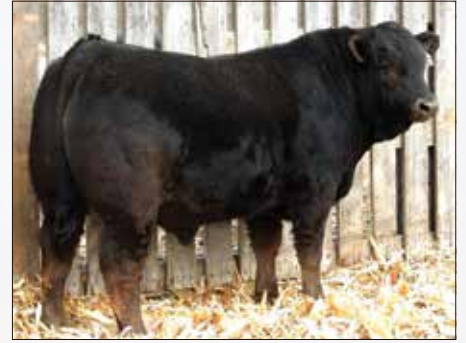
TREF HOT SHOT • Maternal brother to Lot 6