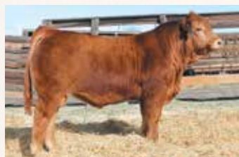
WULFS AMAZING BULL T341A