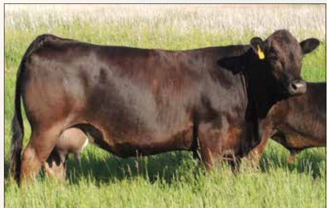
TREF YELLOW JELLO 712Y • Dam of Lot 14