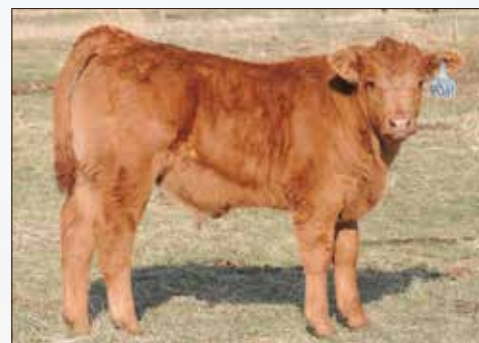
LOT 2 • Pictured as calf