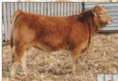
Maternal sib of Lot 13