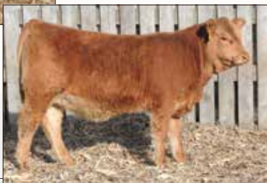
Maternal sib of Lot 13