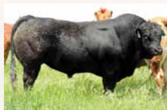
WULFS CAPER 3303C