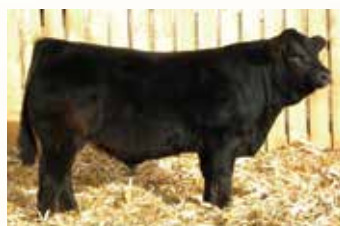
SYES EASY GOING 77E