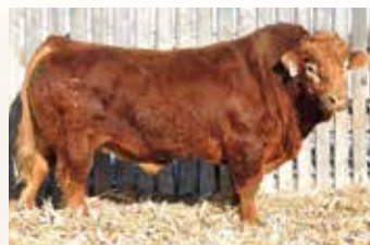
TREF EZ STREET 107E