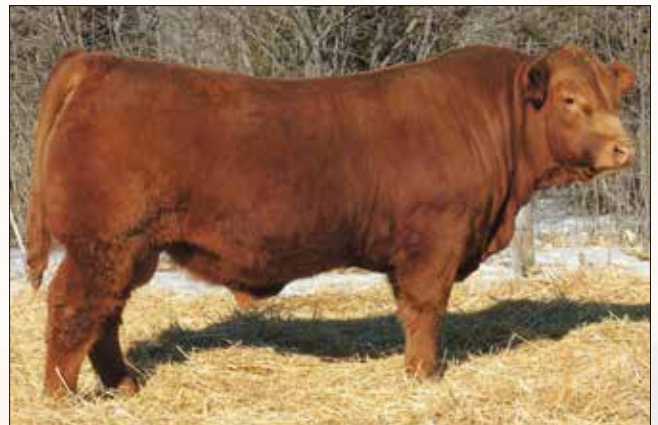
TREF COMMANDER 766C • Sire of Lot 14