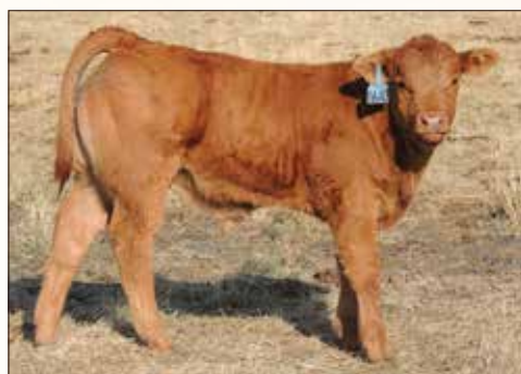
LOT 3 • Pictured as calf