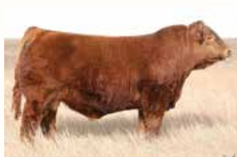
RPY PAYNES DIESEL 37D