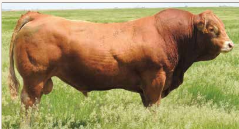
TOMV DIESEL 619D • Sire of Lots 10 & 11