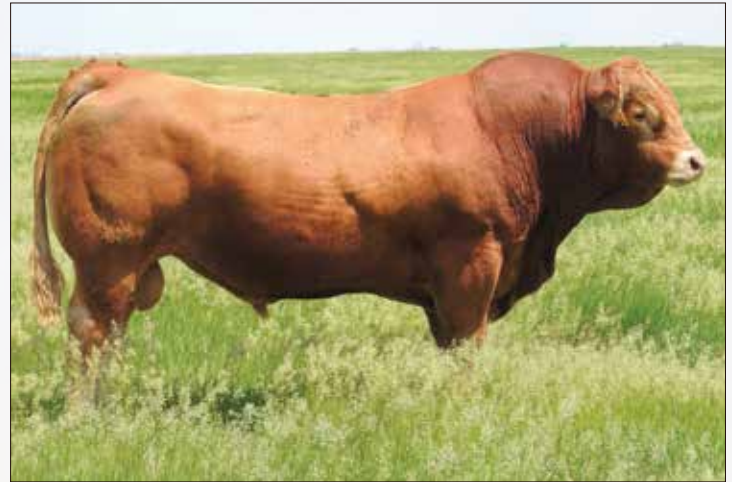
TOMV DIESEL 619D • Sire of Lots 15, 16, 18 and 19