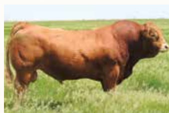
TOMV DIESEL 619D