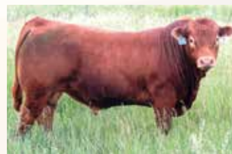
TREF GRAND SLAM 111G