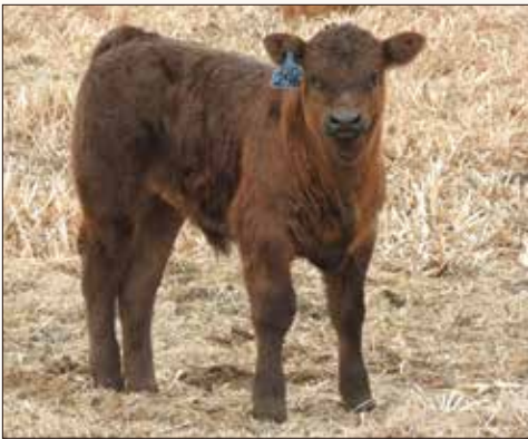
LOT 7 • Pictured as calf