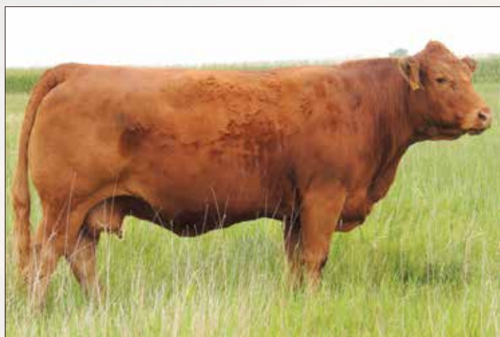
TREF YAKIRA 766Y • Dam of Lots 1-5