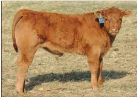
LOT 5 • Pictured as calf