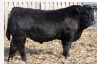
TREF GUNPOWDER 290G