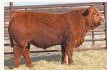
WULFS FIAT K683F ET