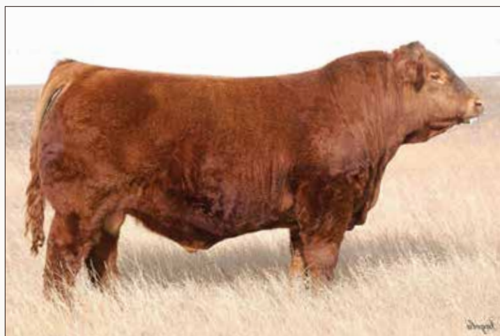
RPY PAYNES DIESEL 37D • Sire of Lots 1-5

RETAINING ONE THIRD INTEREST CALVING EASE: E