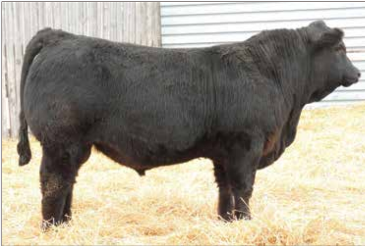
TREF DONE RIGHT 707D • Sire of Lot 8