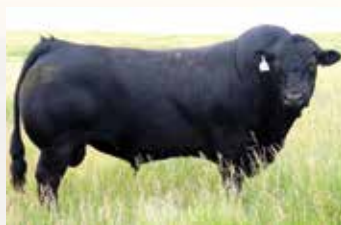
TREF DONE RIGHT 707D