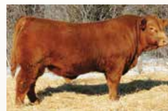
TREF COMMANDER 766C