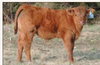
LOT 1 • Pictured as calf