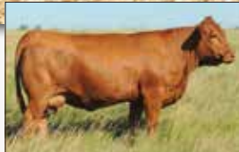
TREF ANGELICA 939A Dam of Lot 15