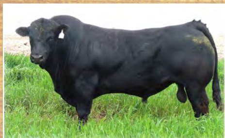
TREF DONE RIGHT 707D