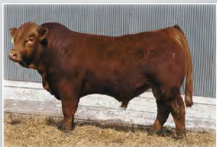
TREF WARLORD 334W (SON)