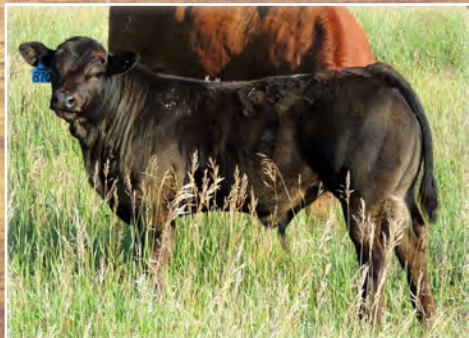
TREF 870G (TREF DONE RIGHT SON)