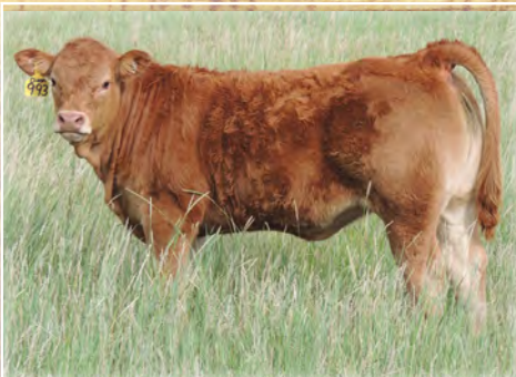
TREF 594G (TOMV DIESEL DAUGHTER)