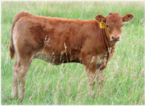
TREF 577G (COLE DAZZLE DAUGHTER)