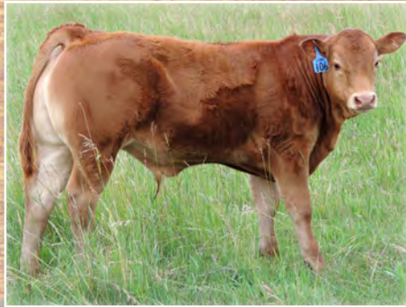
TREF 106G (TOMV DIESEL SON)