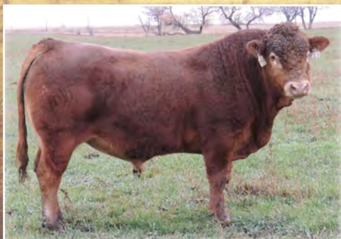
TREF EZ STREET 107E