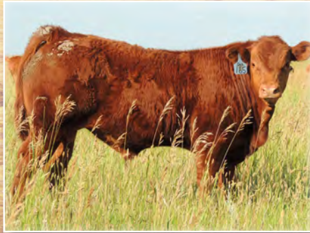
TREF 165G (COLE DAZZLE SON)