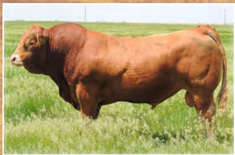
TOMV DIESEL 619D

This group of powerful, "Front Pasture" bulls take care of the natural breeding duties and will be represented strongly in our 2020 sale.