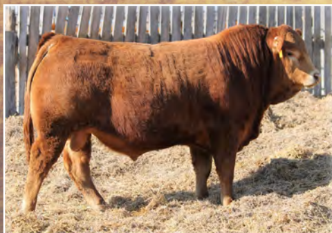
B BAR BENTLEY 8D