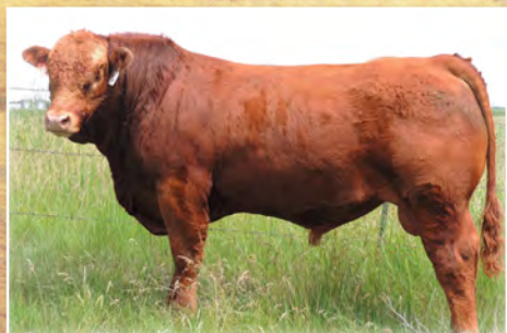
WULFS FIAT K683F ET

Walking our pastures this spring was this popular lot we purchased in the 2019 Wulf sale, Wulfs Fiat K683F. This son of Hunt Credentials, out of the herd sire producing donor Wulfs Soloist, has epds in the top 1% for REA, marbling, and CW making him a perfect carcass bull.