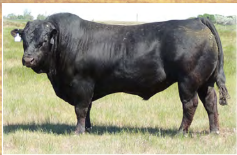
TREF COAL TRAIN 707C