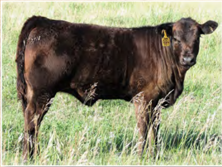
TREF 584G (TREF DONE RIGHT DAUGHTER)