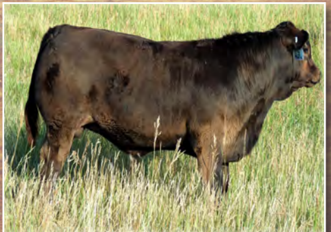
TREF 707G (PAYNES DIESEL SON)