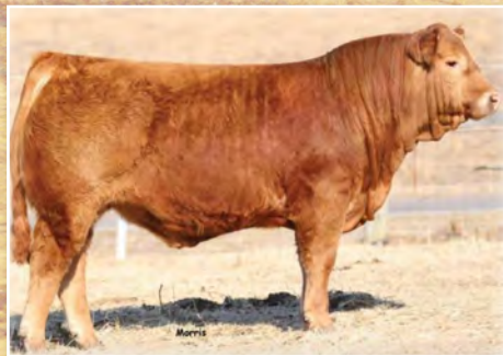
GLDL J BAR J EXCLUSIVE 704E

We will have several red and black heifers bred to these stout bulls available this fall for sale at private treaty. Also will be 20 F1 black baldie heifers bred to Limousin bulls.