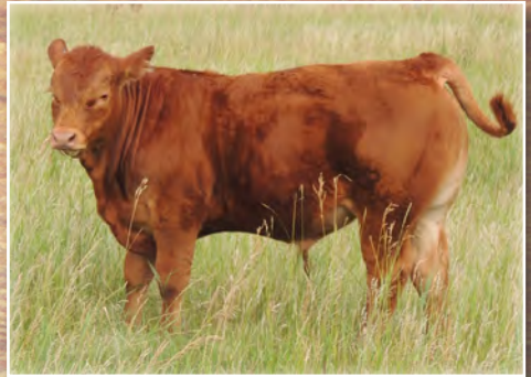
TREF 111G (TREF COAL TRAIN SON)