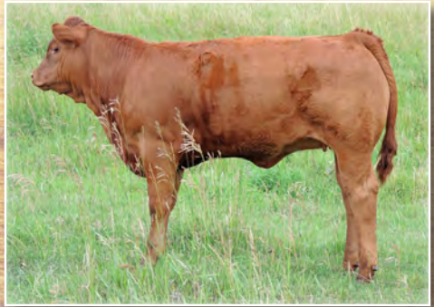
TREF 592G (PAYNES DIESEL DAUGHTER)