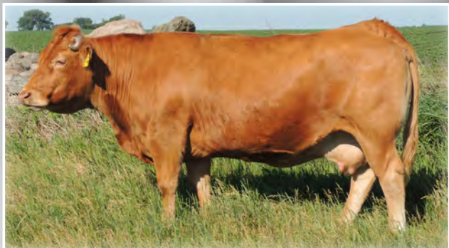
TREF 334G PICTURED AT 19

Proving the longevity of Limousin cows is this soon-to-be 22 year old matriarch, TREF 334G, aka Granny. Surviving the historic winter of 1997 as a young calf and then the brutal winter of 2019, this remarkable foundation cow has put countless daughters and granddaughters into our herd and several bulls in our sales. She will spend what days (or years) she has left grazing our pastures and taking it easy.