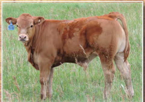
TREF 918G (TOMV DIESEL SON)