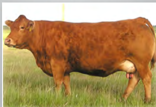
TREF 734L (DAUGHTER)