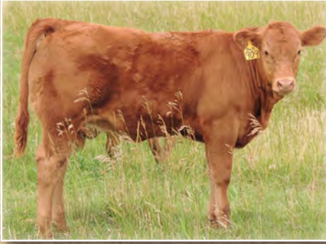
TREF 509G (PAYNES DIESEL DAUGHTER)