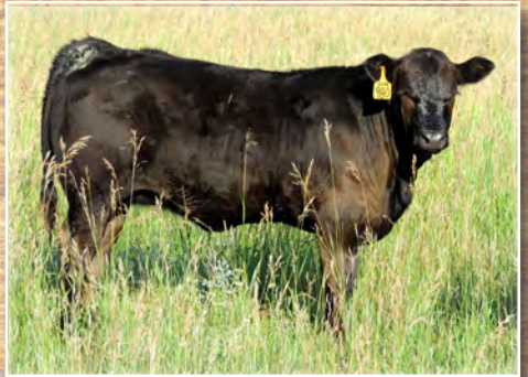
TREF 580G (TREF DONE RIGHT DAUGHTER)