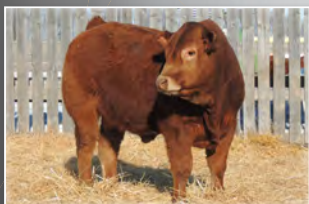
TREF ZODIAK 334Z (SON)