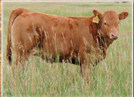
TREF 597G (WULFS AMAZING BULL DAUGHTER)