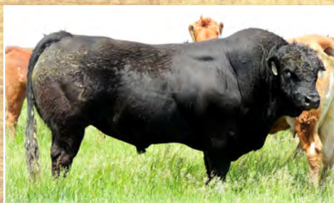
WULFS CAPER 3303C