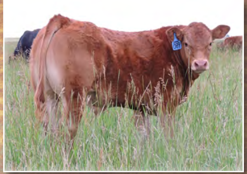
TREF 089G (TOMV DIESEL SON)