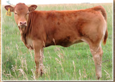
TREF 518G (TREF EZ STREET DAUGHTER)